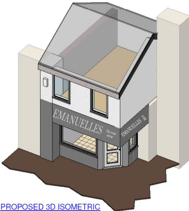
PROPOSED 3D ISOMETRIC