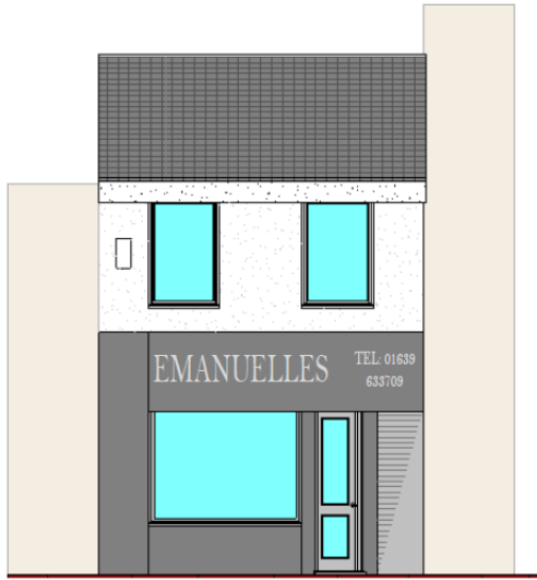
PROPOSED ELEVATION (FRONT)